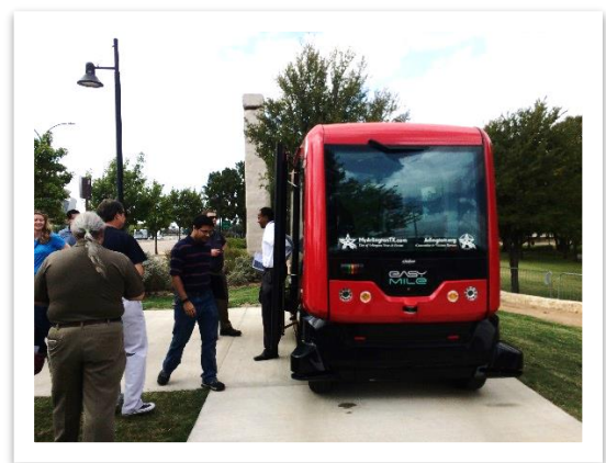
TexITE Dallas members get to know Milo, which started running this year on City trails adjacent to AT&T Stadium and Globe Life Stadium before and after Cowboys and Rangers games.